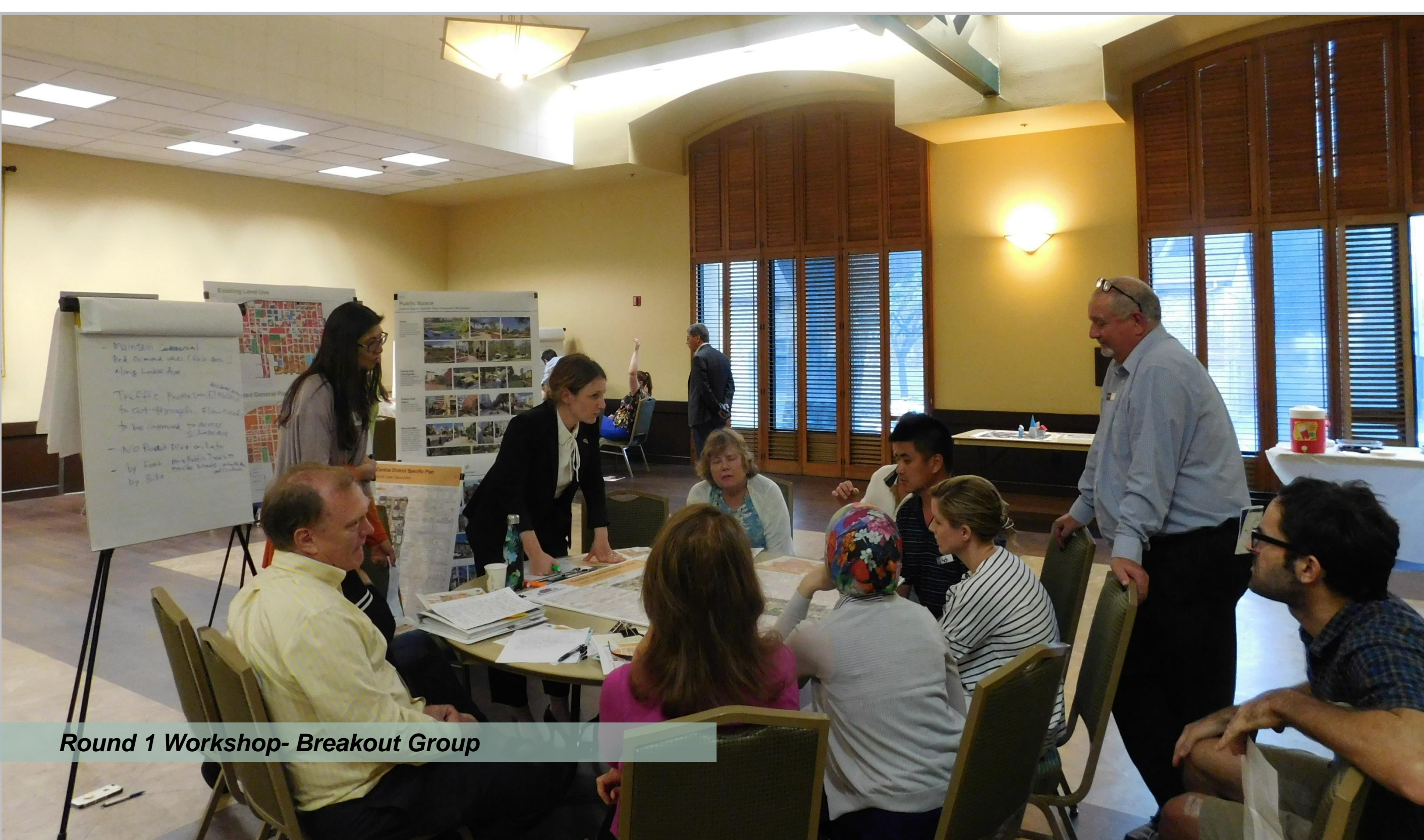
Round 1 Workshop- Breakout Group