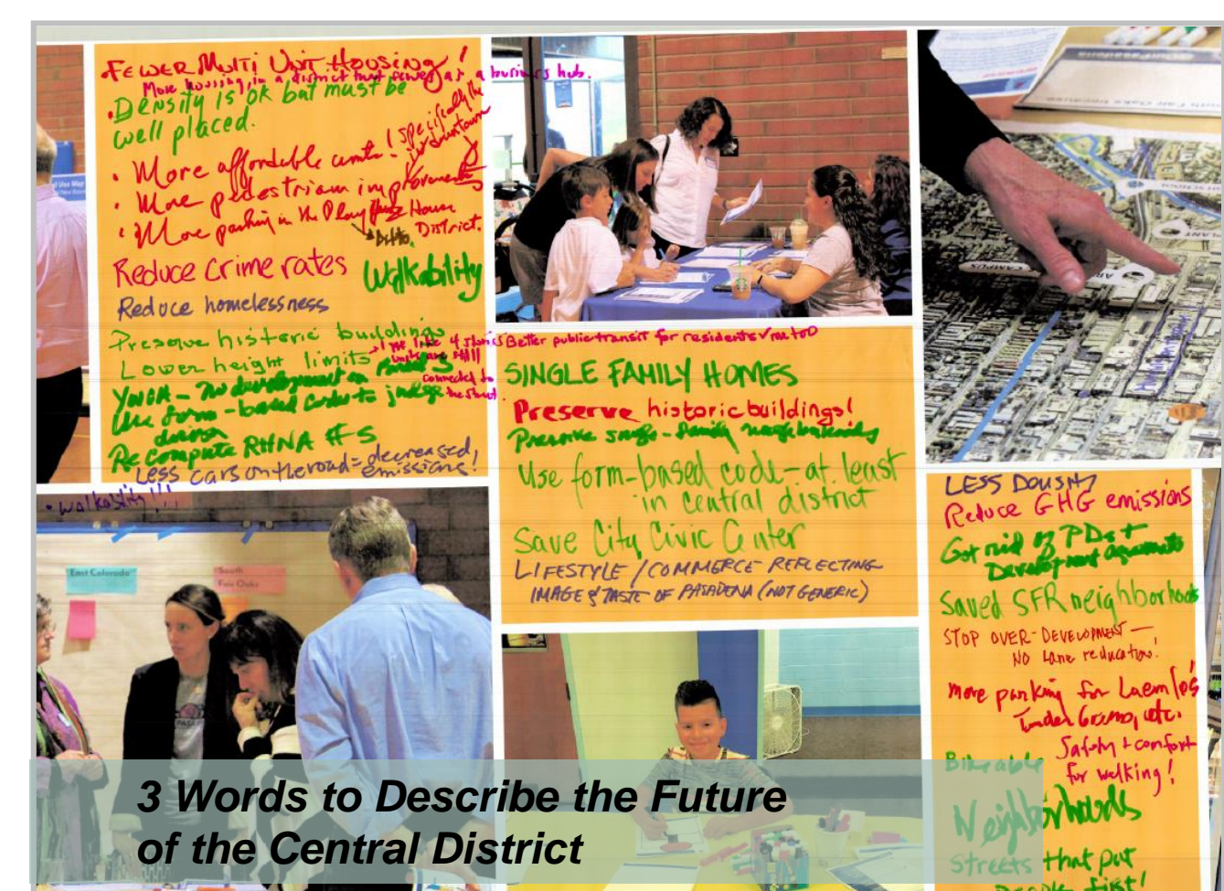
3 Words to Describe the Future of the Central District