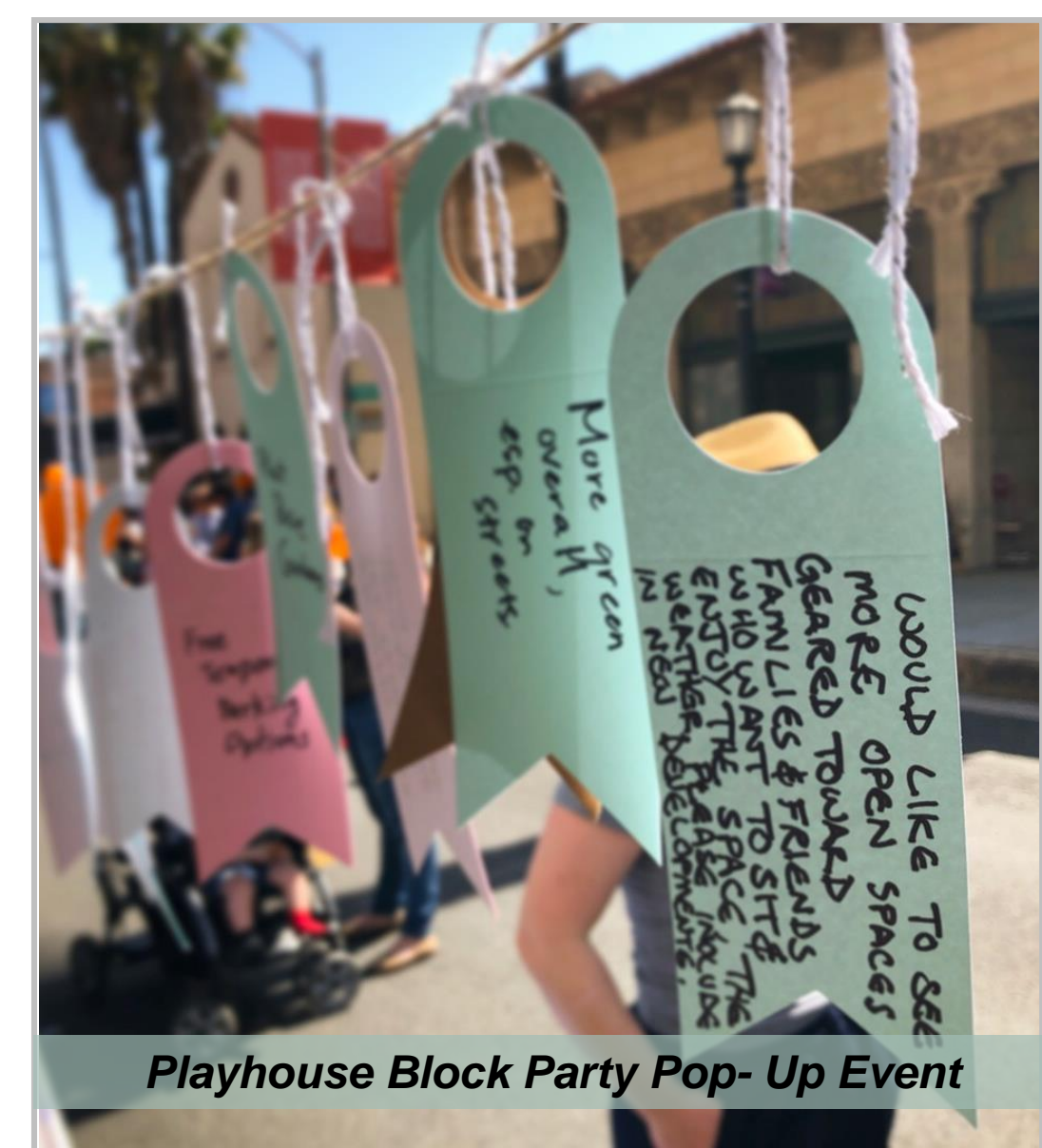
Playhouse Block Party Pop-Up Event