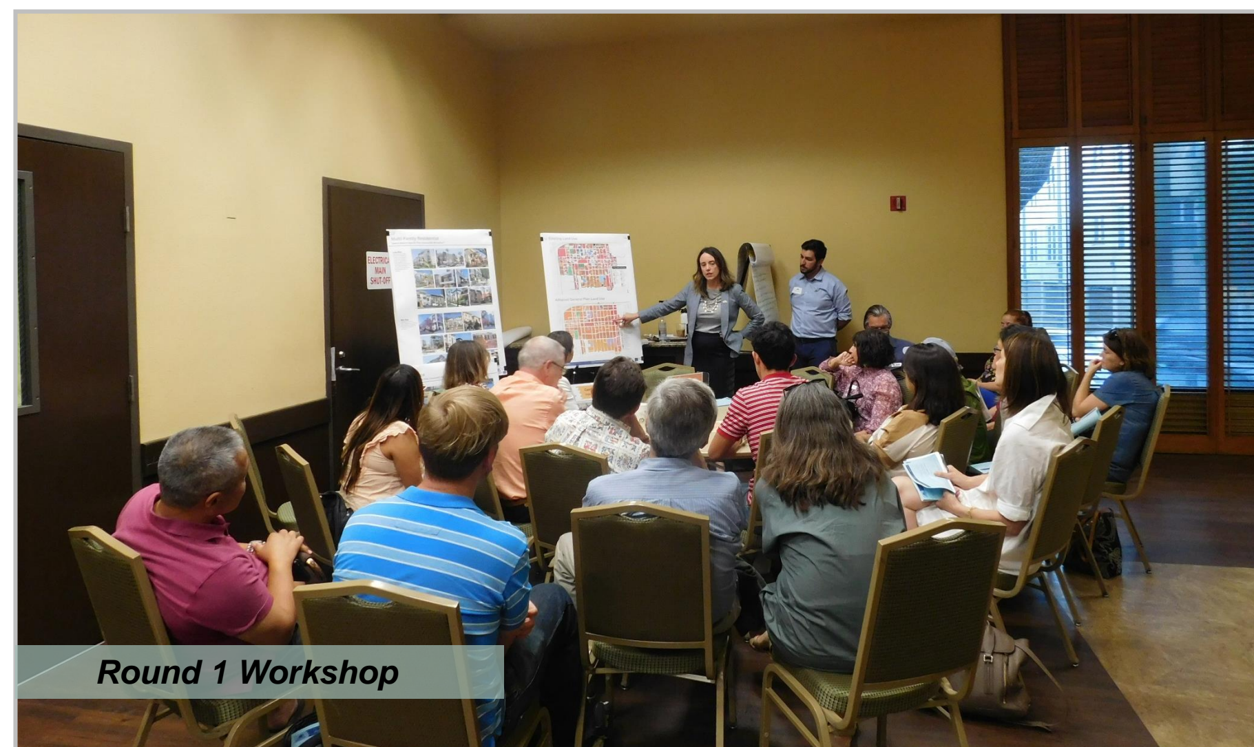
Round 1 Workshop