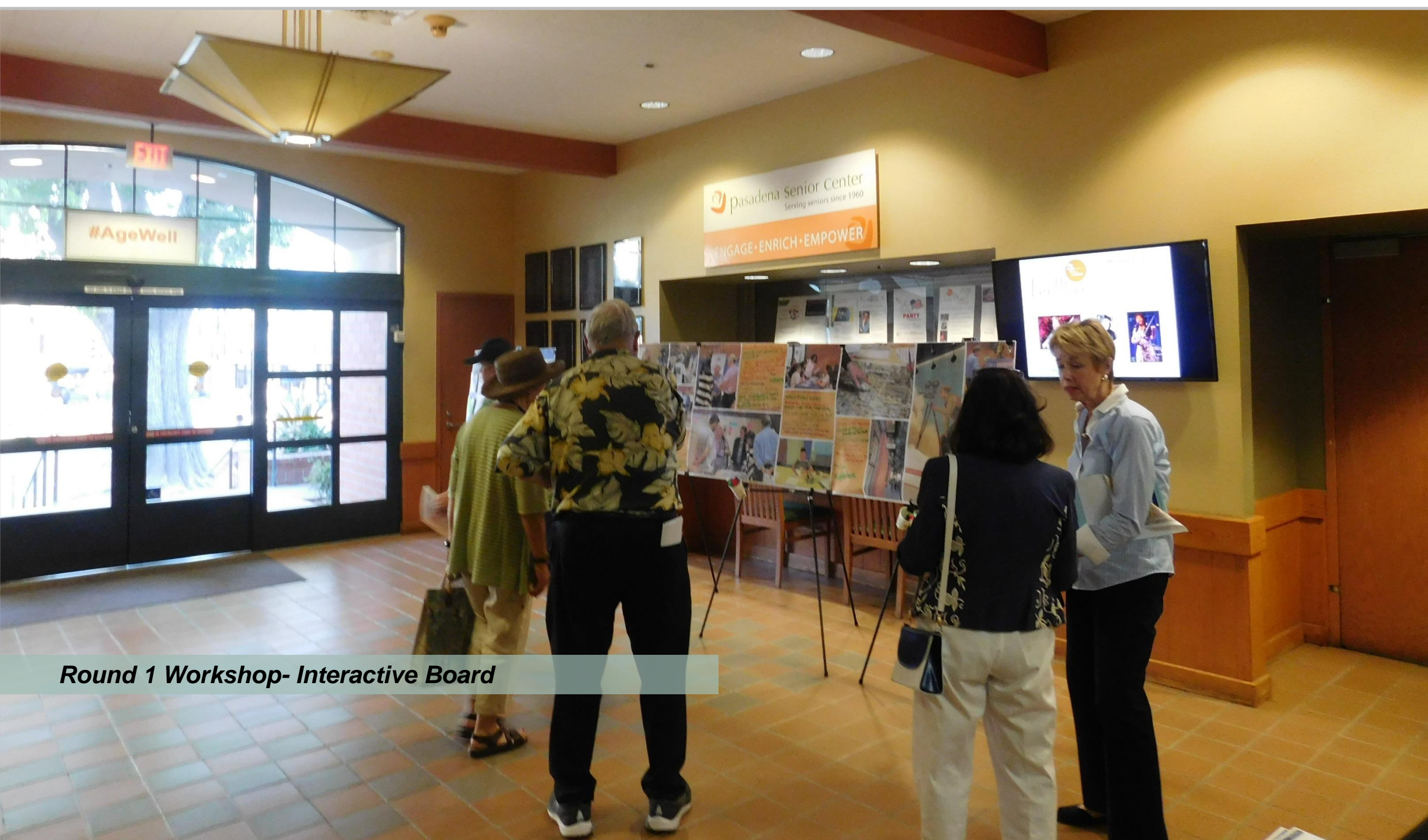
Round 1 Workshop- Interactive Board

To reaffirm what we heard, place a sticker beside the comments that are most important to you.