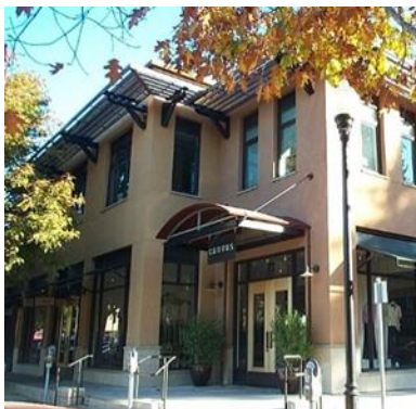
Low-Rise Mixed Use