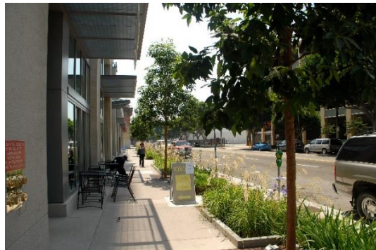
Landscaping in Parkway