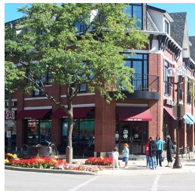
Mid-Rise Mixed Use