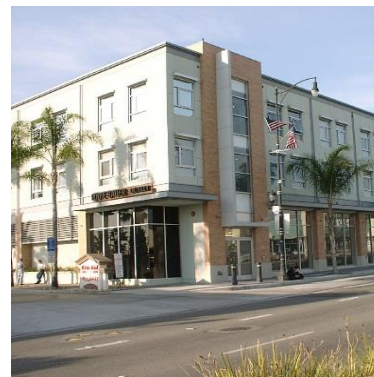
Mid-Rise Mixed Use