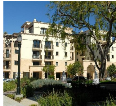
Mid-Rise Residential (4+ stories)