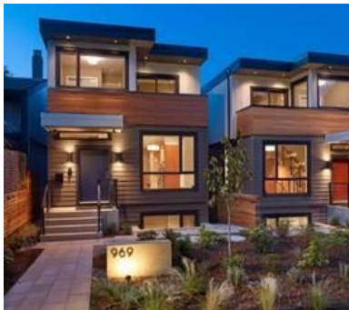
Low-Rise Residential (2 stories)

What type of development would be appropriate for this area? There are several sample images below – please circle the ones that you feel would be appropriate for this area.