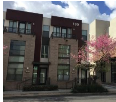
Low-Rise Residential (3 stories)