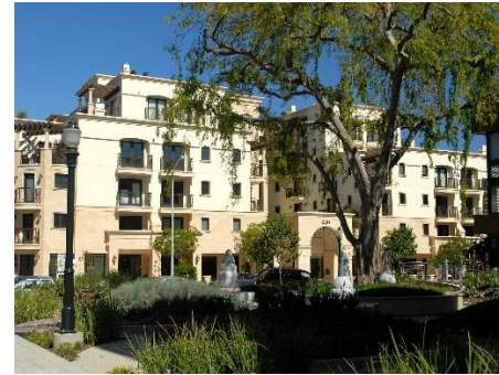
Mid-Rise Residential (4+ stories)