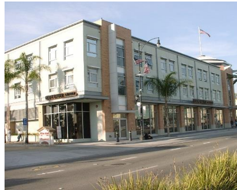
Mid-Rise Mixed Use