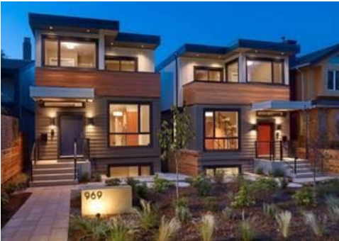
Low-Rise Residential (2 stories)

B. There are several sample images below – please circle the ones that you feel would be appropriate for this area.