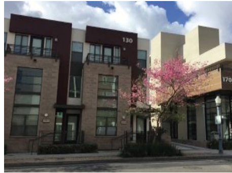
Low-Rise Residential (3 stories)