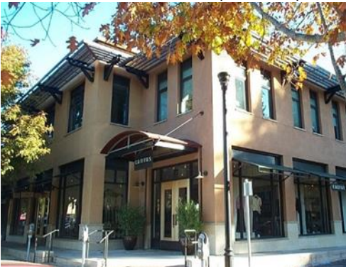
Low-Rise Mixed Use