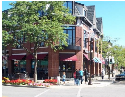
Mid-Rise Mixed Use