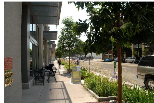
Bioswale in Parkway