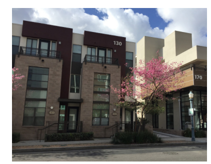
Low-rise residential, 3 story